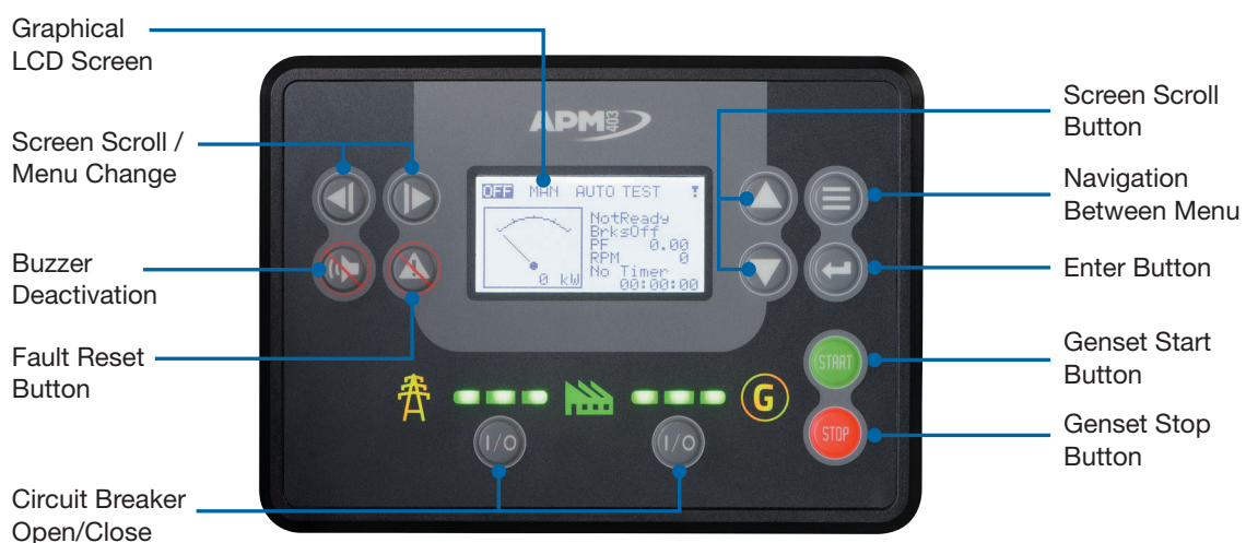
APM403P Front Panel